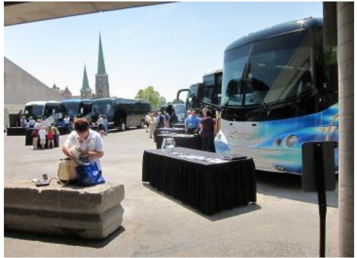
Operators visiting the table top and bus displays during the Industry Expo held on Wednesday, June 15