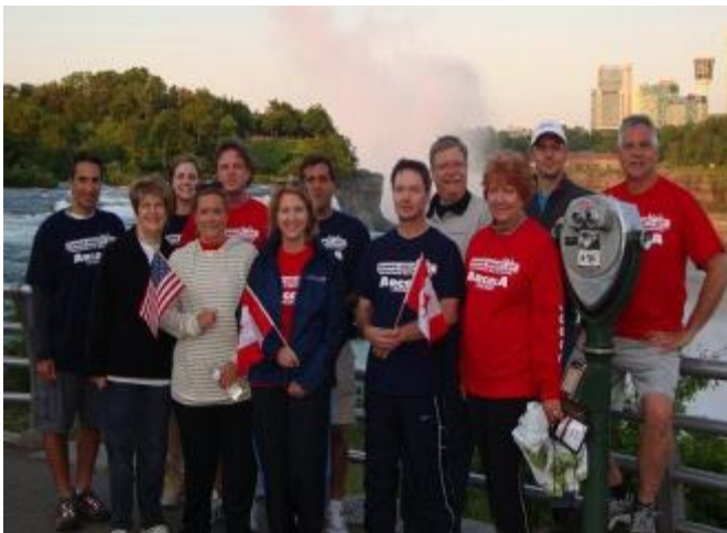
Participants of PBA's first annual Power Walk sponsored by Arcola Bus Sales

followed by a Reception and Dinner at The Top of the Falls Restaurant sponsored by Niagara Tourism & Convention Corporation, Maid of the Mist, and Niagara Falls State Park , after which NTCC had arranged for fireworks! The night concluded with a hospitality suite sponsored by Quality Inn Niagara Falls and Peace Bridge Duty Free Shop Inc.